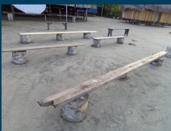
This is where the new church gathers in Chayawita village.