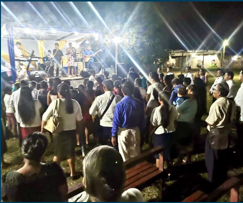
Outreach in Santo Thomas where 60 people came to faith in Jesus Christ.