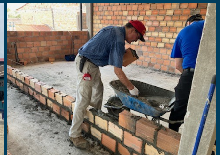
Progress is being made on the MEPI Academy expansion project left wing, second level.