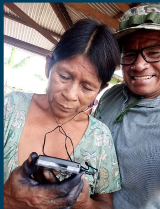
After coming to Christ and having her hand healed, this Shawi lady also received an audio Bible. The Shawi women use the fruit of the Wito tree to color their hands and feet black.