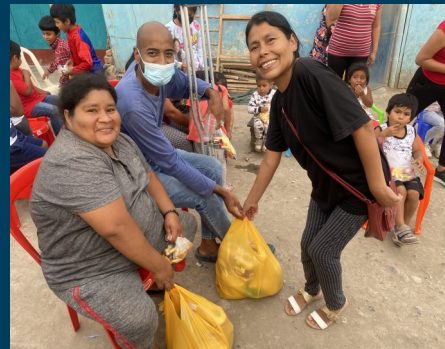
We ministered in two communities while in Pisco where churches have been planted. It was a blessing to distribute food and supplies to 100 families.