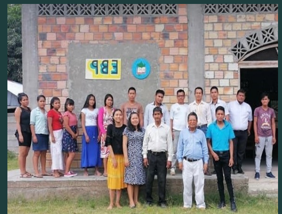
Some of the students at MEPI Bible Academy in Contamana