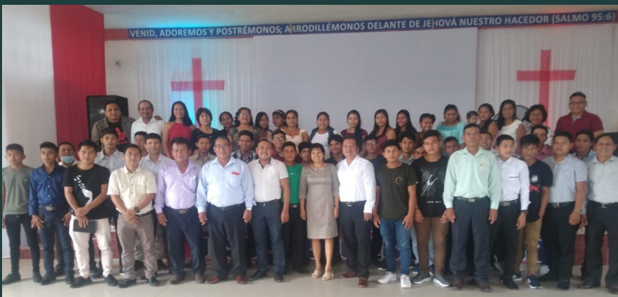
MEPI Bible Academy in Iquitos

The Peruvians hunger for education and discipleship is humbling. If we continue with the trend of previous classes, somewhere between 30 to 40 percent of our students will end up in traditional ministry roles serving as lead pastors, evangelists, worships pastors, youth pastors, or in other ministerial roles in the church. The remaining students will go on to serve God in the public sector serving as law enforcement officers, medical professionals, teachers, small business owners, construction workers, farmers, housewives, social workers, and as ambassadors for Christ in many other occupations. They will all use their gifts and callings to spread the gospel and love of Christ. Years ago, I was frustrated with the percentage of how many were called into the fivefold ministry. I have come to appreciate and realize the significant impact that every person makes through their calling by God to manifest and demonstrate His Kingdom. I am so thankful that the Spirit of God is calling and training young and old people alike to be ministers of grace in numerous spheres of influence which brings light into dark places.