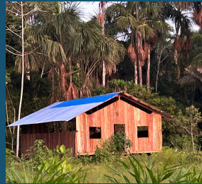
SAN JUAN CHURCH